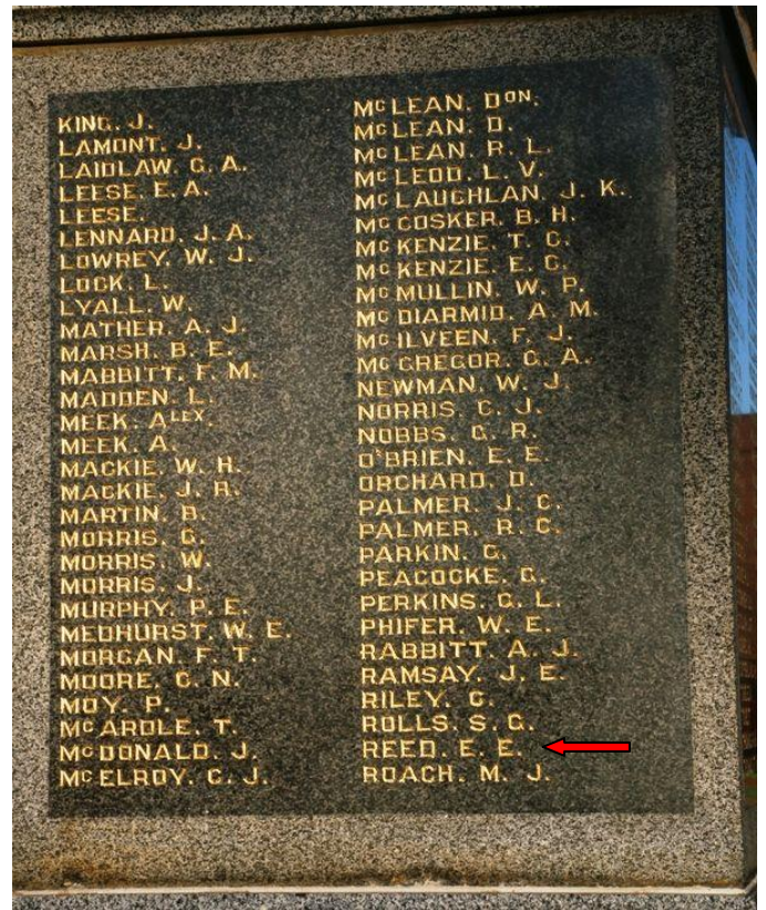
Inverell War Memorial