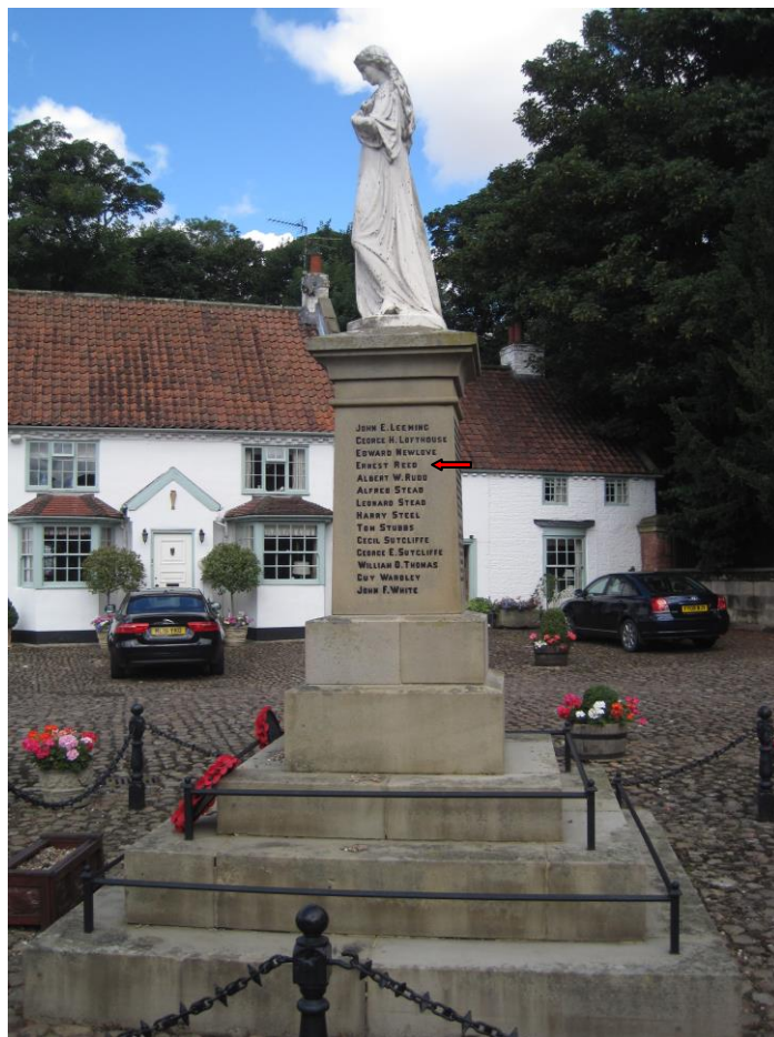
Boroughbridge War Memorial