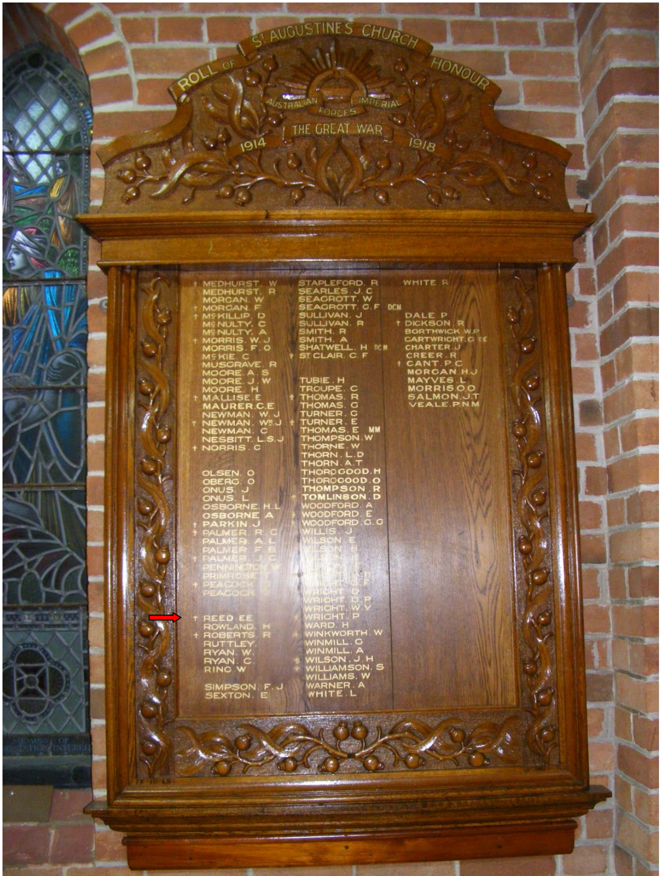
St. Augustine's Great War Roll of Honour, Inverell