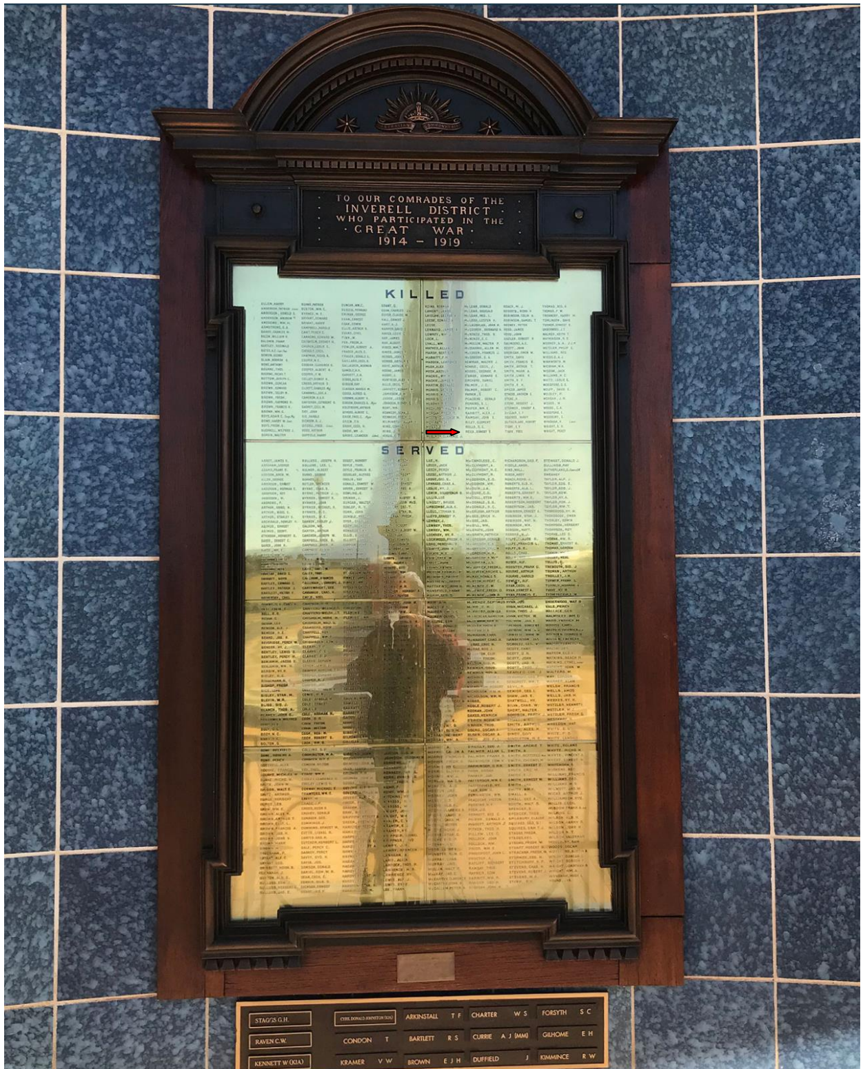
Inverell Memorial Olympic Pool First World War Honour Roll