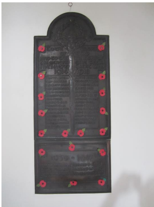
St. James Church Roll of Honour, Boroughbridge