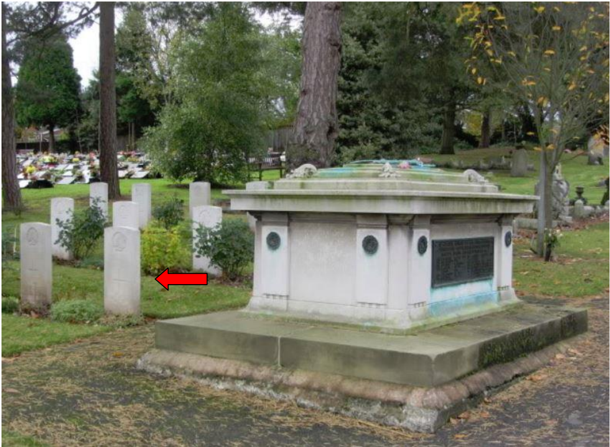
Arrow showing the Plot where Australian WW1 War Graves are located