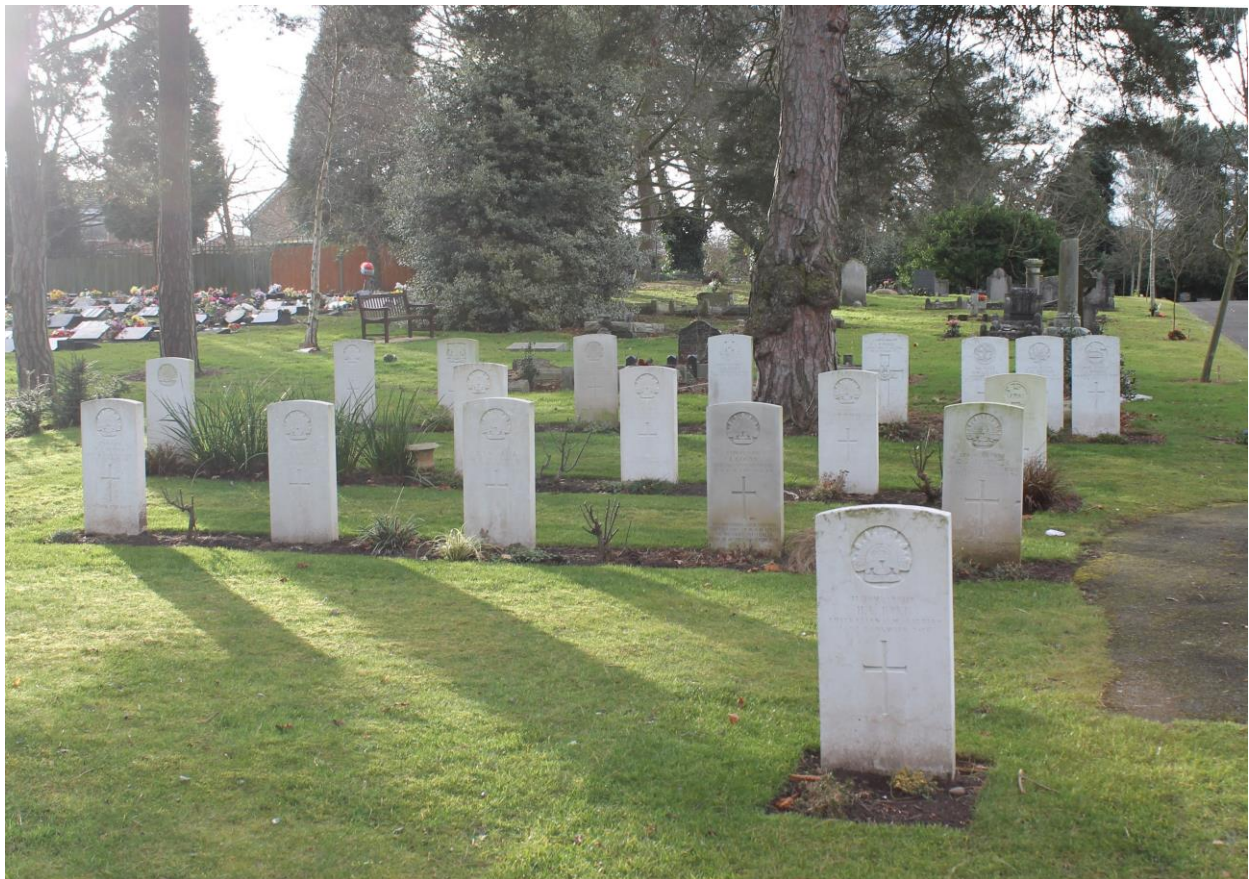
Stourbridge Cemetery showing Australian WW1 War Graves